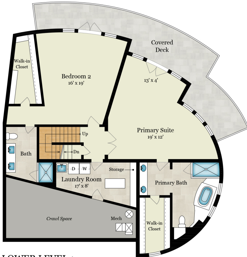
LOWER LEVEL 1 1,460 SQ FT