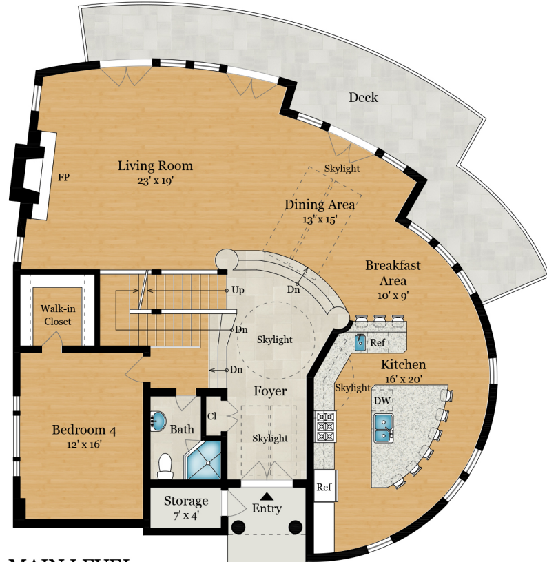
MAIN LEVEL 1,685 SQ FT