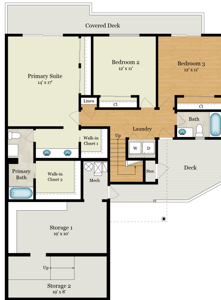
LOWER LEVEL 1,120 SQ FT