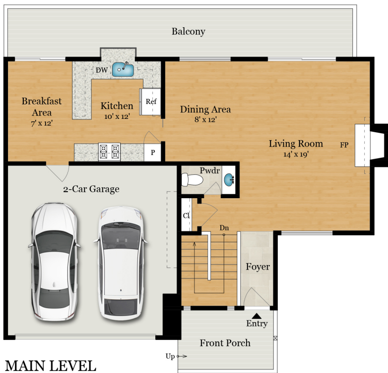
MAIN LEVEL 795 SQ FT

Estimated Total Finished Square Footage: 1,915 SQ FT