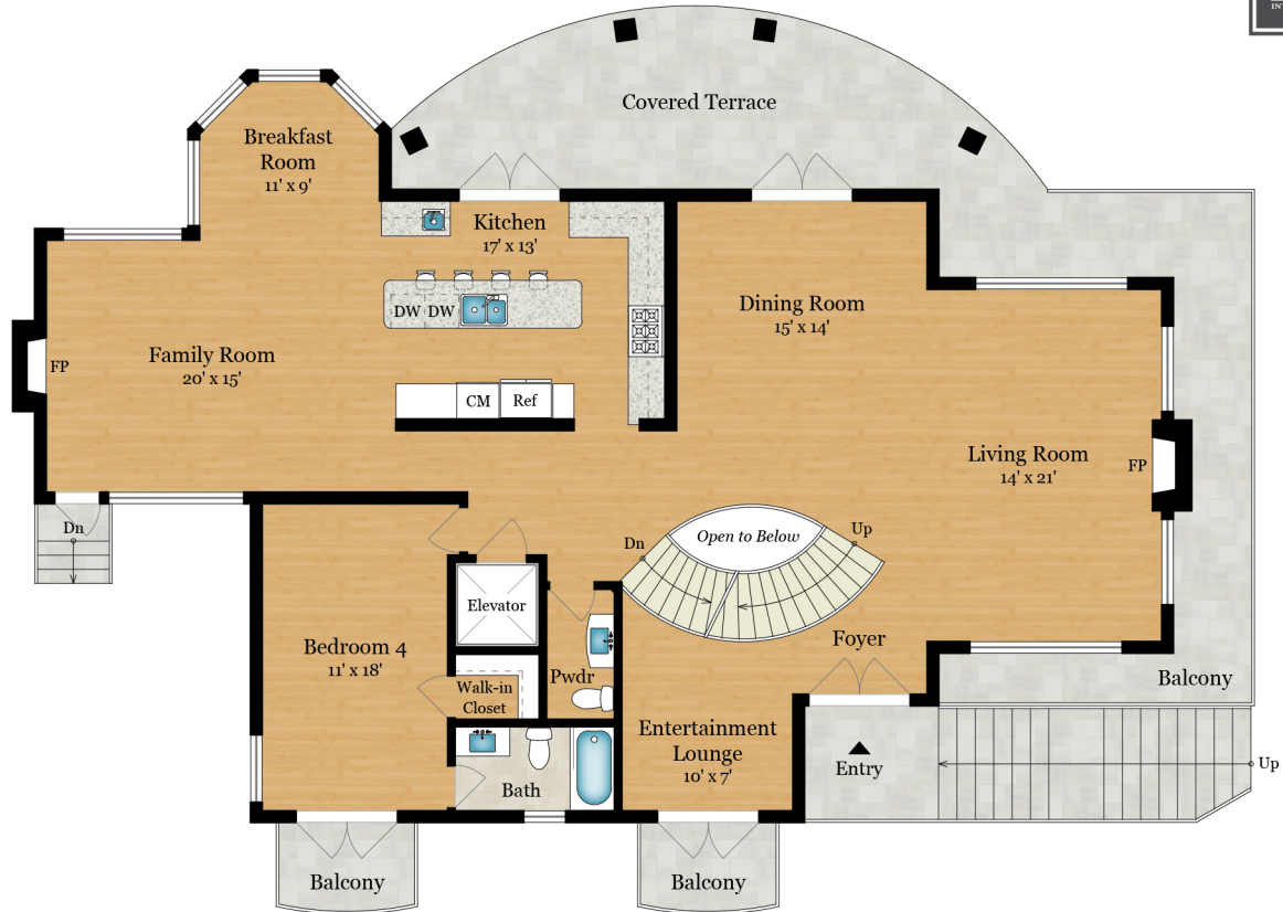
MAIN LEVEL 2,030 SQ FT